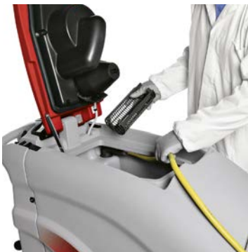
Easy to clean squeegee hose which, if cleaned regularly, helps to keep suction efficiency