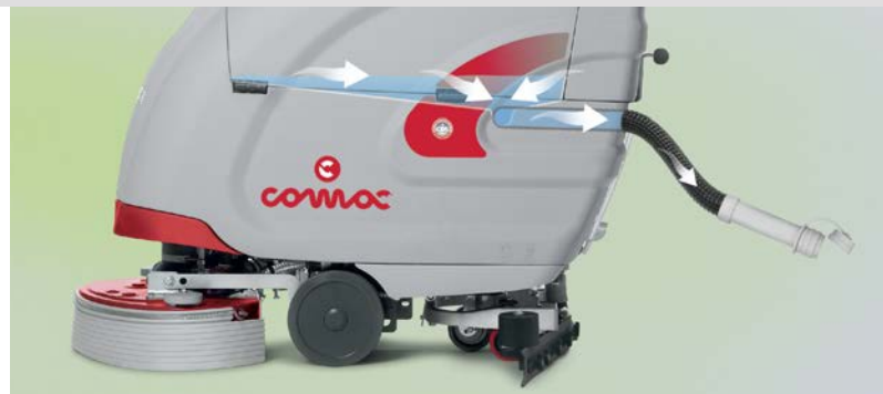
Thanks to its special design and to the large drain hose, the recovery tank can be completely emptied of dirty water very quickly without leaving any residue