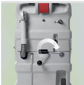
The squeegee is raised and lowered thanks to a handle

The machine is easily recharged by connecting the cable to a wall mains socket.