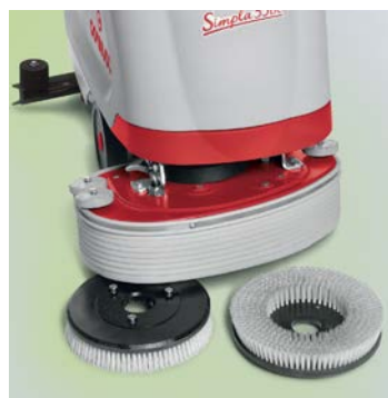
On both scrubbing versions (Simpla 50/55/65) and the sweeping version (Simpla 50 BTS) it's very easy to replace brushes without specialised personnel