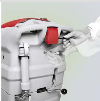
Very safe with the new parking brake