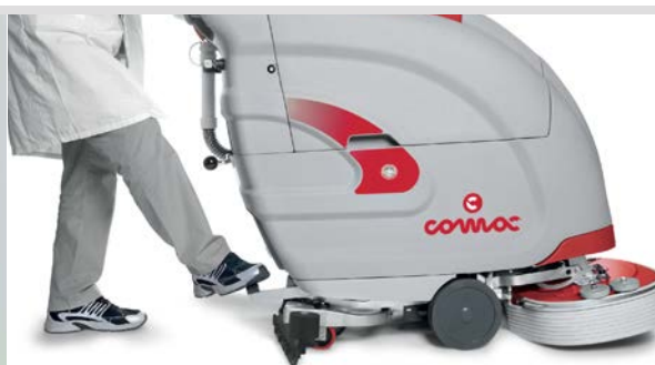
Thanks to a pedal the scrubbing head can be raised very easily and without efforts