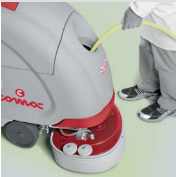
Thanks to the wide inlet it is very easy to fill the tank

Furthermore, their technical and design devices make the machine extremely reliable and efficient.