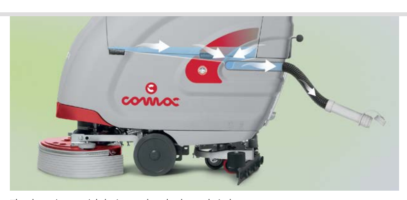
Thanks to its special design and to the large drain hose, the recovery tank can be completely emptied of dirty water very quickly without leaving any residue