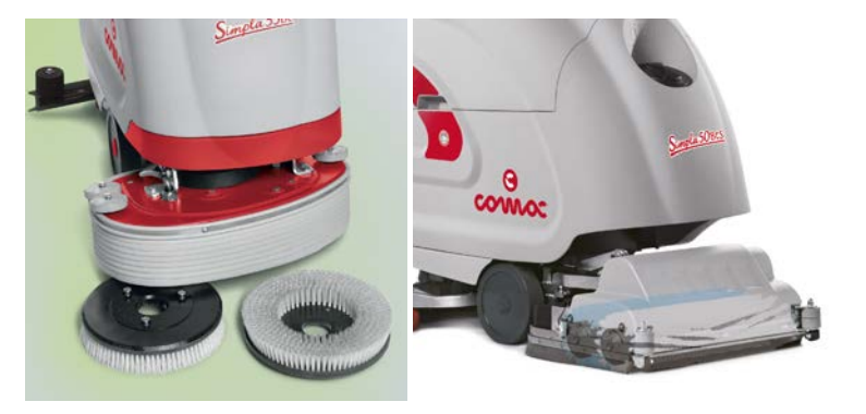
On both scrubbing versions (Simpla 50/55/65) and the sweeping version (Simpla 50 BTS) it's very easy to replace brushes without specialised personnel