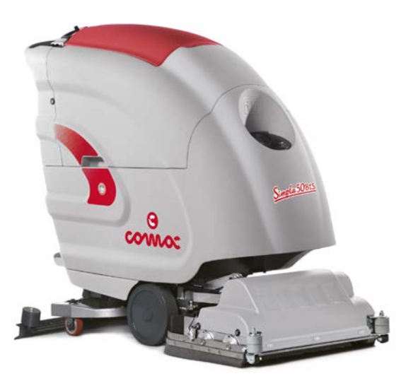
Simpla 50 BTS is the sweeping version of the Simpla family. It has a debris hopper to collect small solid waste

The manual adjustment by means of a cock used on traditional scrubbing machines does not grant the rightr flow rate nor a constant deliver as the tank empties. We often use more water and detergent than needed - from 30 to 50%. CDS is the new water and detergent dosing system made by Comac enabling the operator to dose water and detergent separately, thanks to 2 separate selectors.