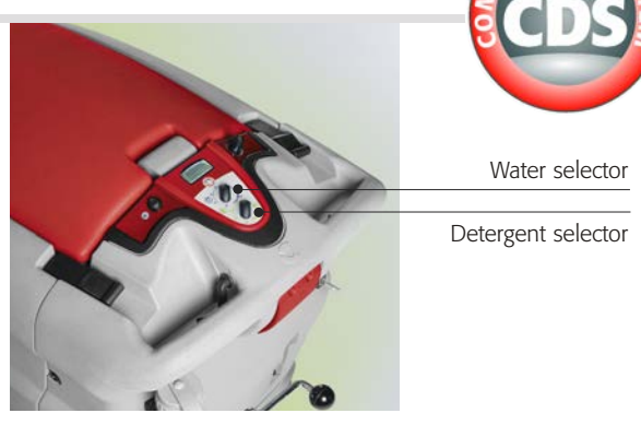
Separate water and detergent management