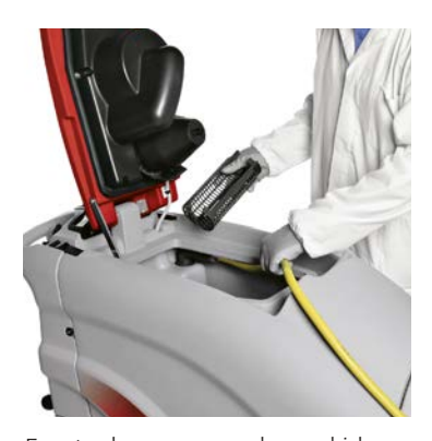
Easy to clean squeegee hose which, if cleaned regularly, helps to keep suction efficiency