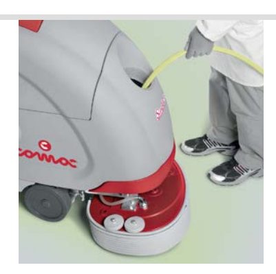
Thanks to the wide inlet it is very easy to fill the tank

• Easy to clean and sanitize in a few words they are user-friendly! Furthermore, their technical and design devices make the machine extremely reliable and efficient.